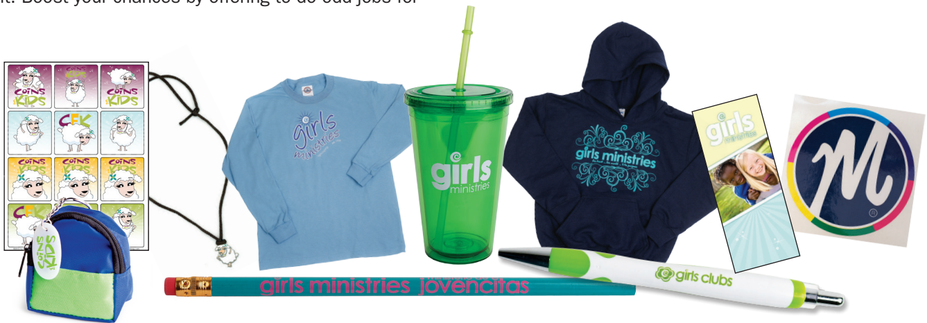
Items pictured (from left to right): Luna the Lamb Stickers (item #147075), Coins for Kids Backpack Coin Purse (item #178027), Luna the Lamb Necklace (item #178026), Girls Ministries Long Sleeve Shirt, Girls Ministries Pencil (item #167221), Girls Ministries Insulated Tumbler with Straw (item #178050), Girls Ministries Hoodie, Girls Clubs Pen (item #167214), Girls Ministries Bookmark (item #136698), Girls Ministries Emblem Sticker (item #086670)

OFFER a prize (such as a Luna the Lamb Necklace , Stickers , or other Girls Ministries gear found in our online store at myhealthychurch.com/girlsclubs ) to each girl who successfully completes the challenge.