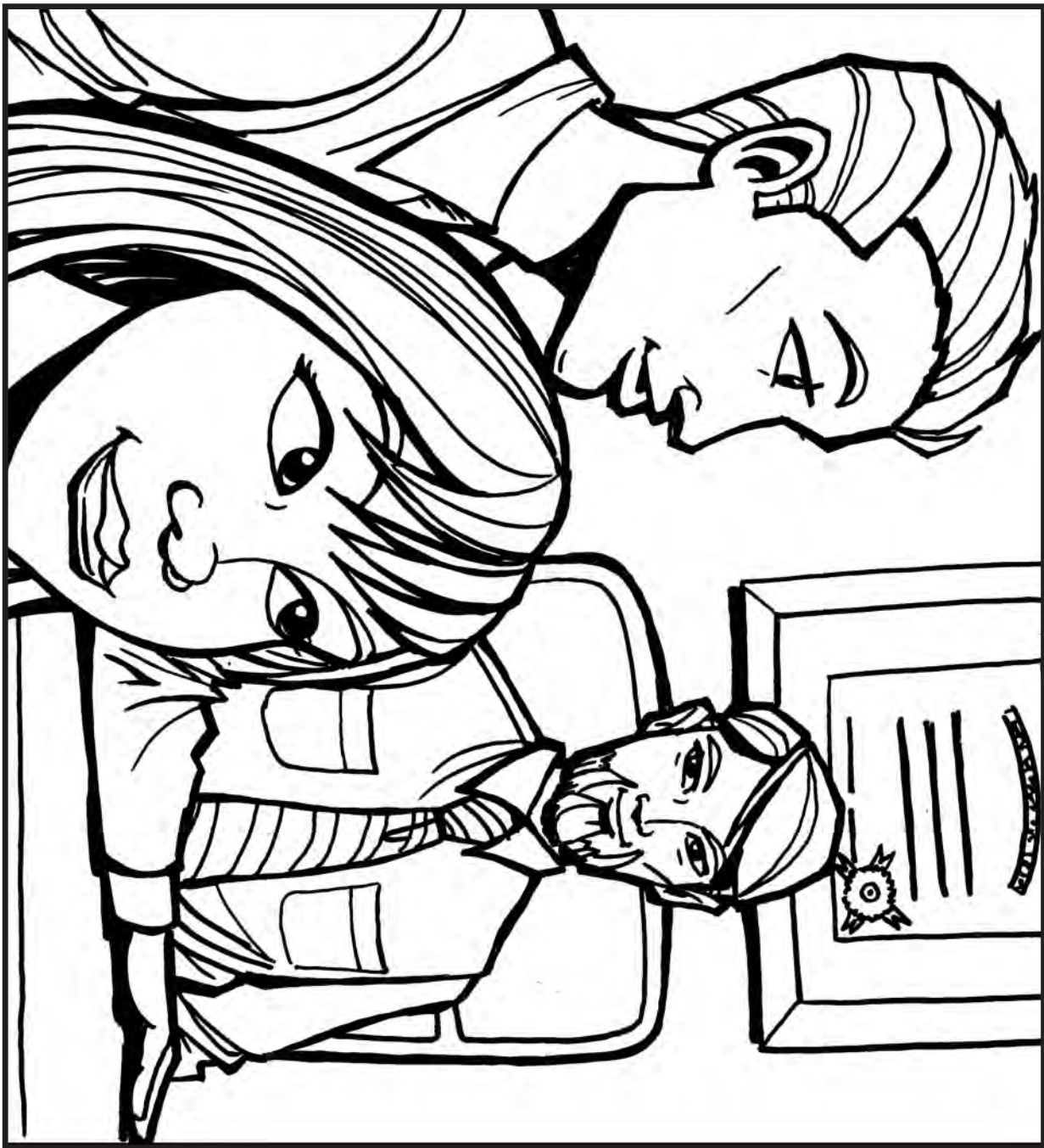
The director of education gave them permission to perform THE PUZZLE in the local schools.